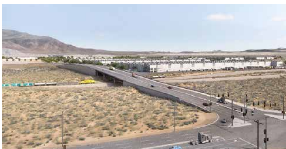
A rendering shows what the Nevada Pacific Parkway overpass may look like