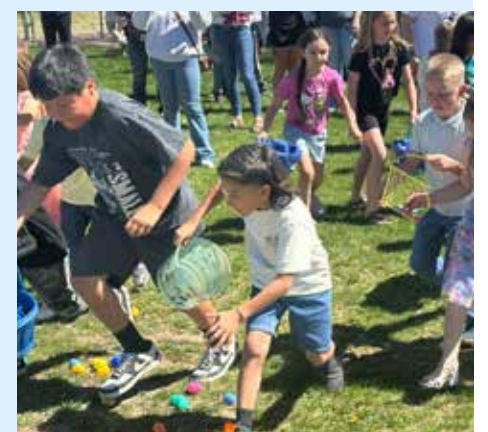
Children from infants up to teenagers scooped up baskets and bags full of plastic eggs filled with candy at last Saturday's Community Easter Egg Hunt hosted by Biggest Little Radio at the Out of Town Park.