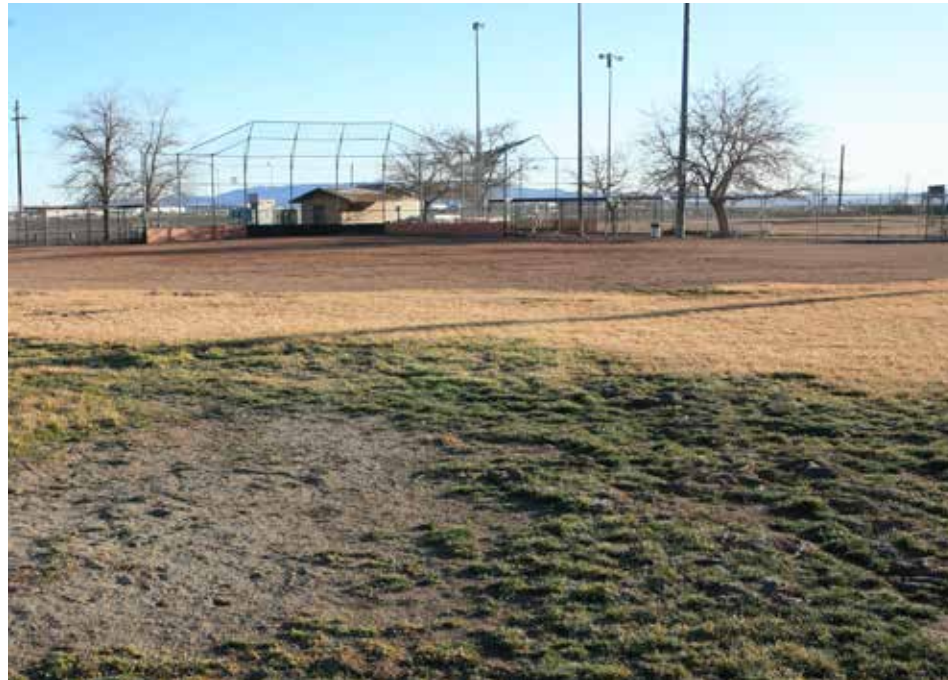
Bare spots and holes in the outfield of a softball field illustrate some of the improvements needed at the Out of Town Park.

However, even with these improvements, the city would probably only get five to 10 years of useful life before the fields would need to be rehabilitated